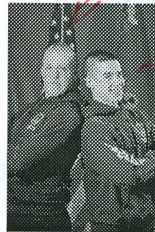
Future Young Marines